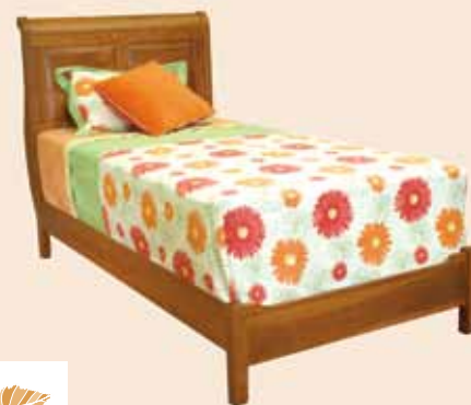
Wellington Solid Panel Sleigh Bed with low profile footboard option.